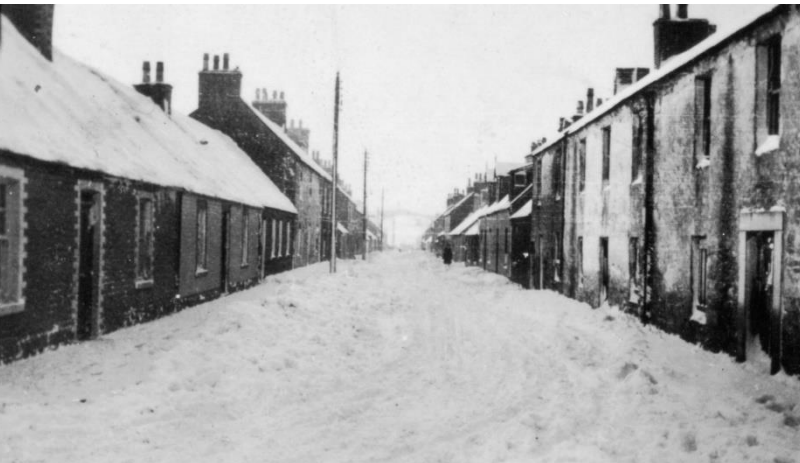
A snow-covered east end of Catherine Street. The 4 two-storey buildings in the right foreground were nos. 1 to 7 and are now demolished